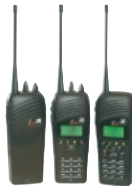
Tait Orca Series Portables