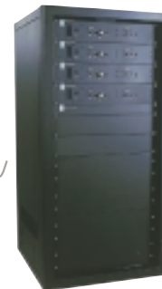
T800SL Radio System