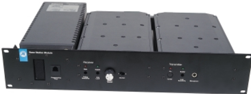
T800SL Base Station