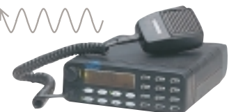
T2000 Series Mobiles

Tait is your complete supplier of radio communications equipment, with mobile, portable and infrastructure solutions. Our experience spans 30 years, covering off-the-shelf and customised products, single site systems and complete turnkey systems.